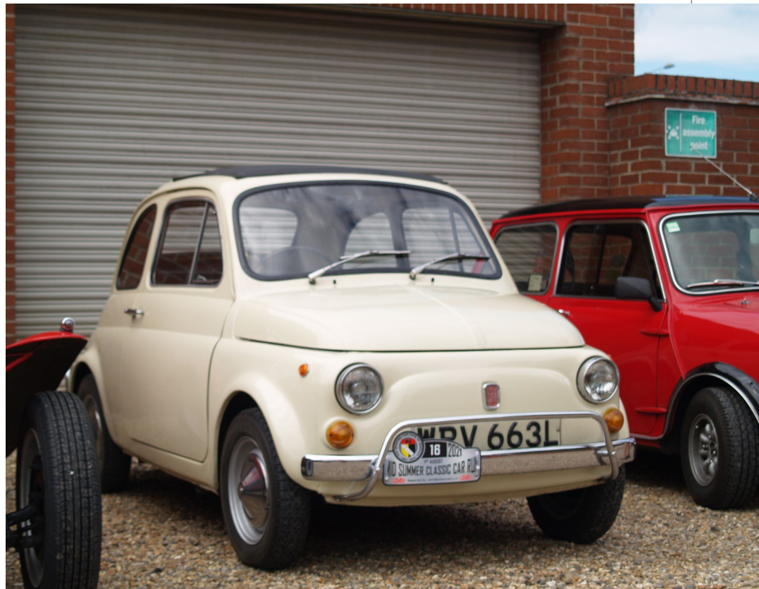
1972 FIAT 500F

There are over 150 photos from the event on social media. Look up SCCoN on Facebook or on Flickr.com