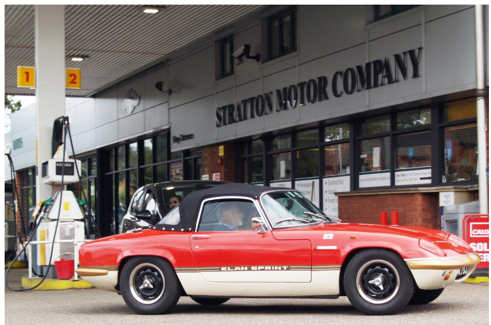
Lotus Elan outside the local dealership