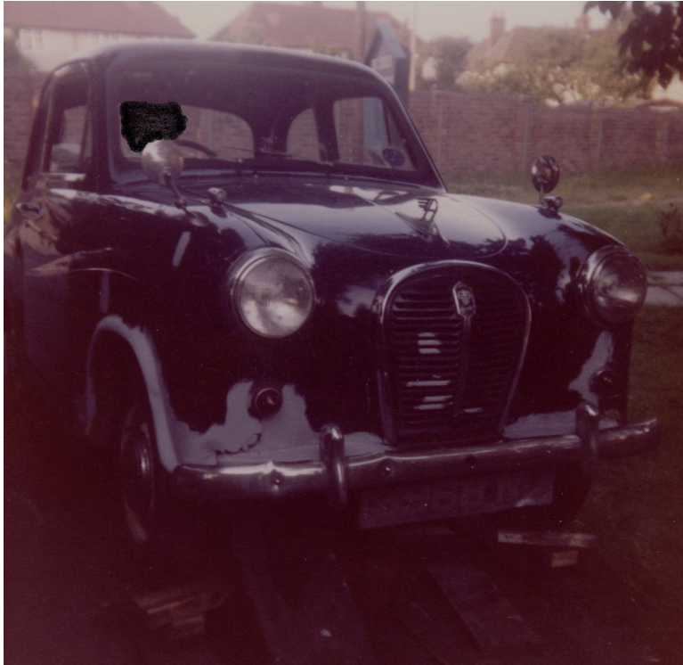
1958 Austin A35 9968NO

after a few months of ownership I advertised it and sold it to a chap in his twenties who was going to fit a 1275 engine and spridget discs. Whether he ever did I have no idea, I never saw it on the road again. DVLA records tell me it is still in existence but it was last taxed about 40 years ago so it may have dissolved by now.