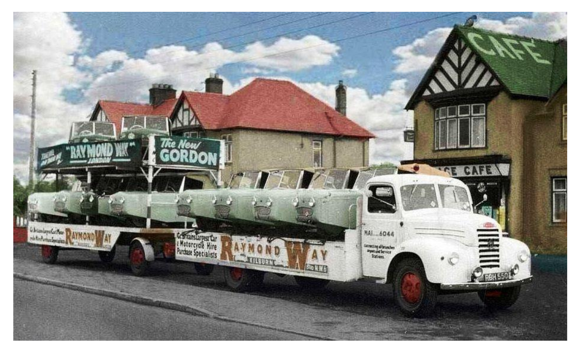
A consignment of ten Gordons being collected by Raymond Way Motors of Kilburn, London

So, what is strange about the Gordon? Well, it was a car with a huge difference in the speed it could take left-hand versus right-hand corners. This little car (10' 2" long x 4' 9" wide) with just one tiny door had a single cylinder 197cc Villiers engine installed under a cover to the right of the driver. It had a 3-speed plus reverse gearbox with chain drive to only the right rear wheel. So, with the weight of the driver on the right and the engine cantilevered even further to the right side of the car (and with very little weight on the left), the Gordon could tip over quite easily during left turns, whereas it could be cornered much faster to the right!