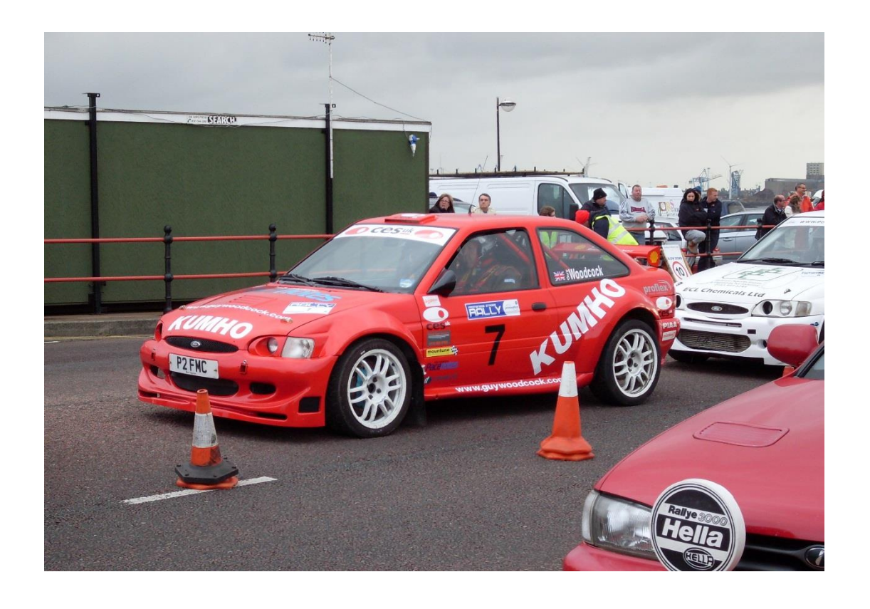
Ford Escort Maxi Kit Car – New Brighton Promenade Stages 2009