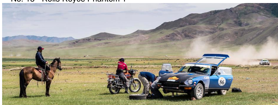
No. 86 - Datsun 240Z