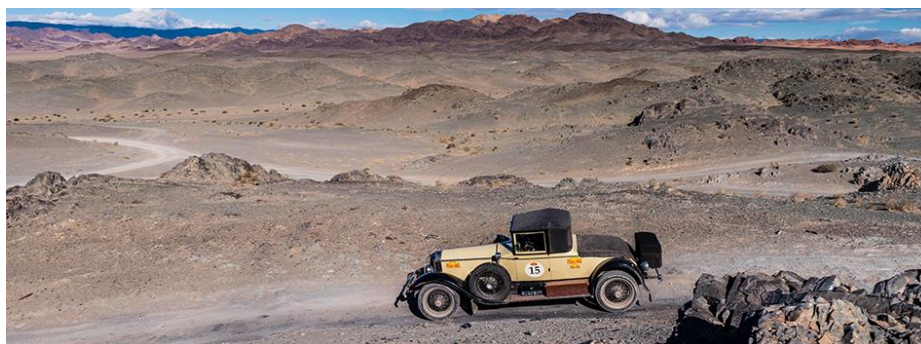
No. 15 - Rolls Royce Phantom 1