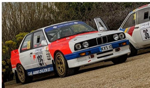
Historic BMW M3

The sun came out as we arrived, so we were able to explore and see the cars as they returned for the final service of the day. One slight disappointment from my perspective was that much of the service area was inaccessible and surrounded by metal fencing. While I understand the problems that the public could potentially cause in a busy service area, it's not something I've ever come across before, even at Wales Rally GB. Given the importance of engaging with the public to promote future participation, I would have liked to see things more open. It's a tough job though, so I don't want to criticise too much.