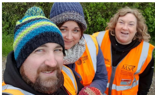
Just some of the SCCoN marshalling team

We weren't to be disappointed, enjoying the first pass of the field as they completed SS4. Sadly, one thing the organisers couldn't control was the weather, which was nothing like as good as last year. This meant we had to endure some rain while we waited for the next loop of stages to start. Thankfully, the local Young Farmers group had set up a beer tent in aid of Essex Air Ambulance, so we were looked after, but I did feel bad for them, as there weren't many spectators sadly.