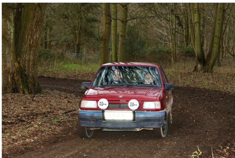
The Stanta Targa featured a variety of challenging surfaces