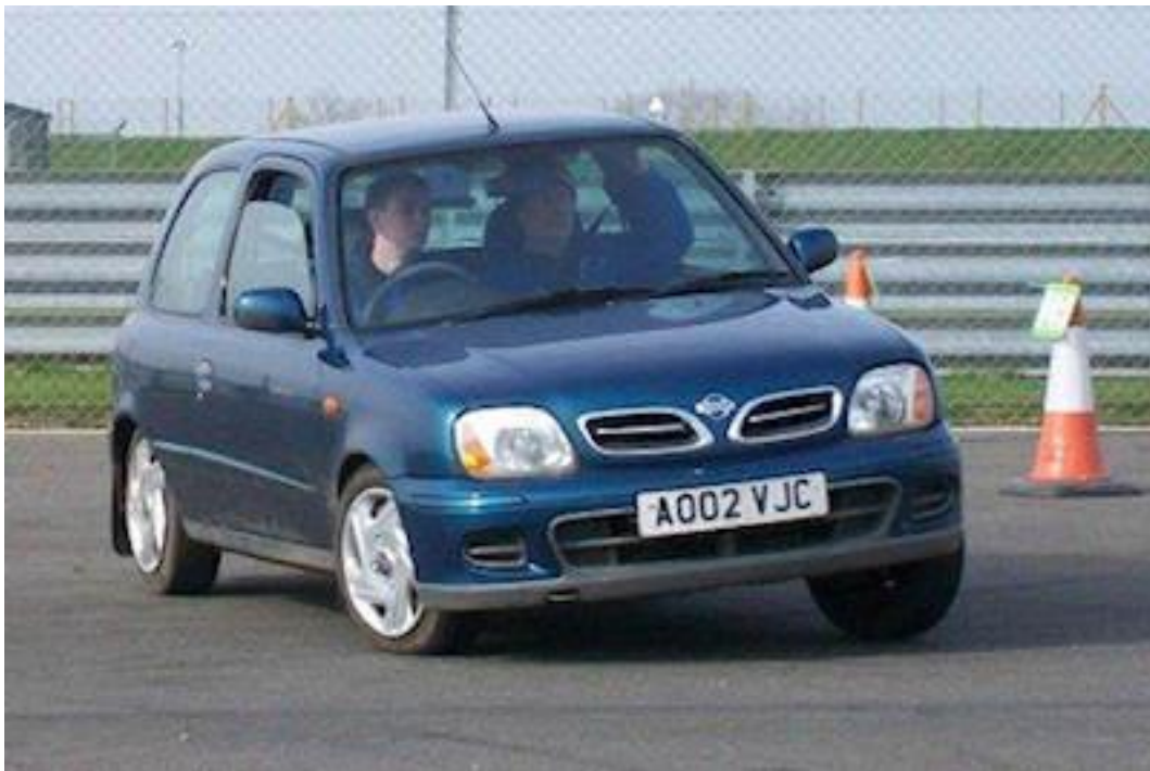
Snetterton Grass Production Car Autotest Sunday 10 th December