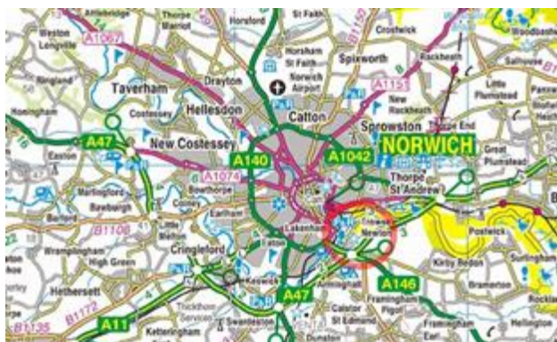
White Horse, Trowse NR14 8ST