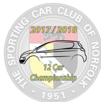
Waveney Mushrooms 12 Car Friday 24 th November