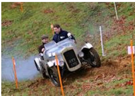
Lyng Garage Car Trial Sunday 12 th November