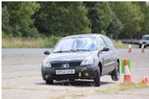
Stanta AutoSOLO Sunday 1 st October