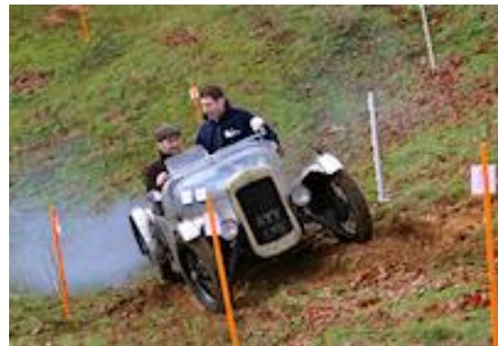
Lyng Garage Trial Sunday 12 th November