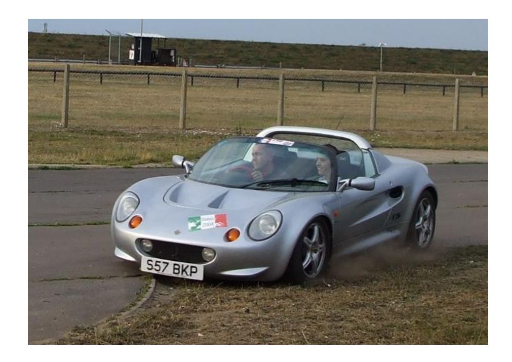
Sunday 11th December 2016