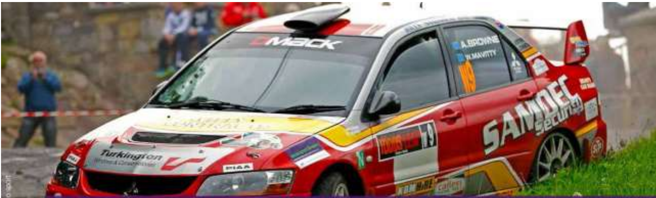
Paul Millroy/TPM photo sport