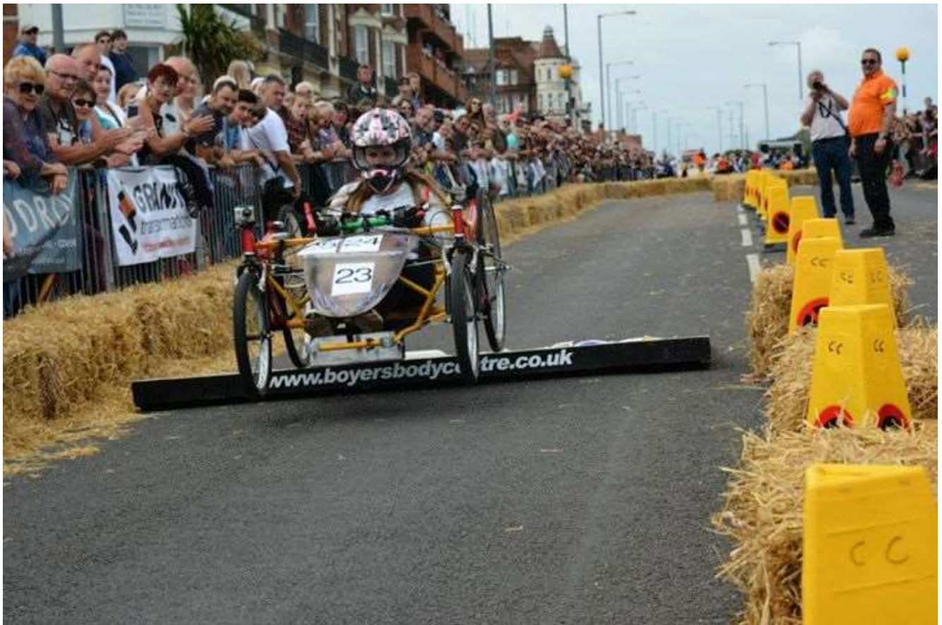
2015 Cromer Soapbox Derby