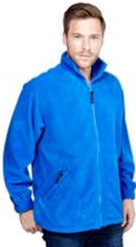
UC601 Premium Fleece UC603 Children's Fleece