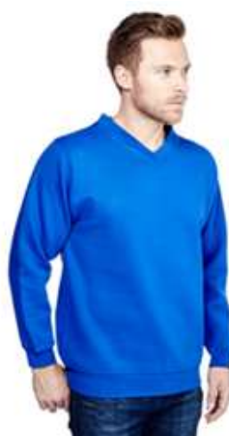
UC204 Vee-neck sweatshirt