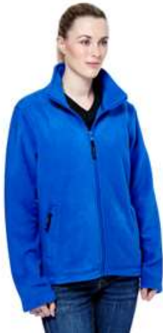
UC608 Ladies Fleece No bottom drawstring