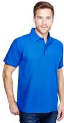
UC101 Classic Polo shirt UC103 Children's Polo shirt