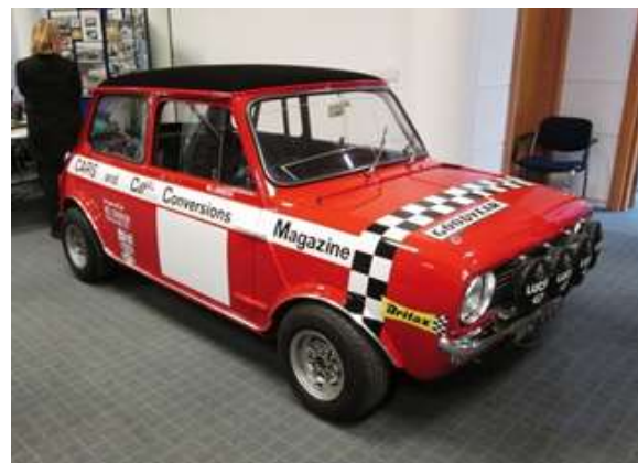
The Mini that won the 1970 RAC Rally Championship

It was pleasing to see that Timo's Mini has recently been sympathetically restored and now has the correct front grille. I competed against this car in 1982 when Paddy Hopkirk used it to win the Lombard Golden 50 Rally, but back then it had a black-painted MkII grille which looked all wrong on a Mk1 Mini.