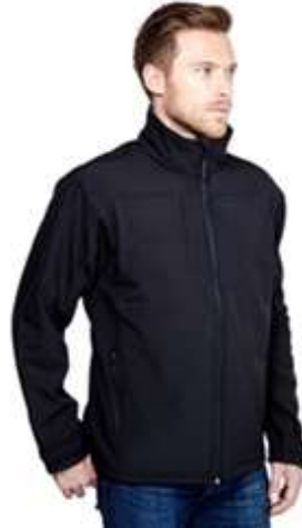
UC611 Premium soft-shell jacket 3-layer waterproof/breathable 3 zip outside & 1 inside pockets