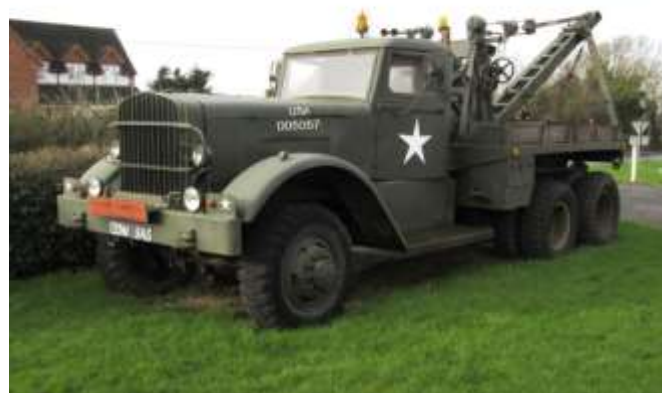
1941 'Ward LaFrance M1' Heavy Wrecker Truck 45mph Continental 8.2 litre 6-cylinder petrol engine 145bhp US Army and British REME in the Middle East & Italy

I was up early the next day to travel to Gaydon for the Historic Rally Car Register's Open Day. On the way, while driving through Shuckburgh on the A425, I saw another ex-WWII truck - an early example of a Ward LaFrance M1 Wrecker Truck. This was the main recovery vehicle of the US Army but some were used by the British Army. During World War II a total of 6554 M20 Diamond T's were built in Chicago and 4925 Ward LaFrance (M1's and M1A1's) were built at Elmira in New York State and by Kenworth Trucks of Washington State in a parallel build. I wonder how many (or how few?) are left today. Both the vehicles pictured here are in full running order.