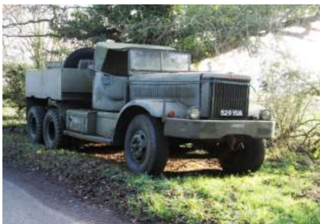
1943 M20 'Diamond T 980' Tank Transporter 23mph Hercules 14.7 litre 6-cylinder diesel engine 185bhp Used by the British Army mainly in N.Africa