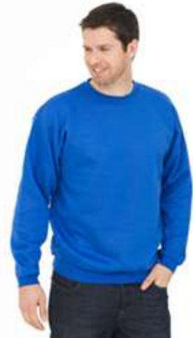
UC201 Premium Sweatshirt UC203 Children's Sweatshirt