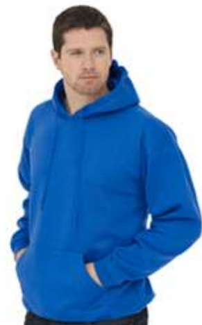
UC501 Hooded sweatshirt