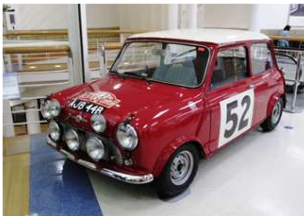
The Mini that won the 1965 Monte Carlo Rally

brand new, but wrongly assembled, brake pressure distribution valve. As soon as I entered the main hall, I saw the very car that first sparked my interest in rallying - Timo Makinen's 1965 Monte Carlo Rally winning Morris Mini Cooper S. The '65 Monte was one of the snowiest ever and, of 267 entrants, only 35 crews reached Monte Carlo and were classified as finishers. This number was reduced to just 22 cars still running at the finish, when 14 more dropped out during the final 380 mile night-time Mountain Circuit.