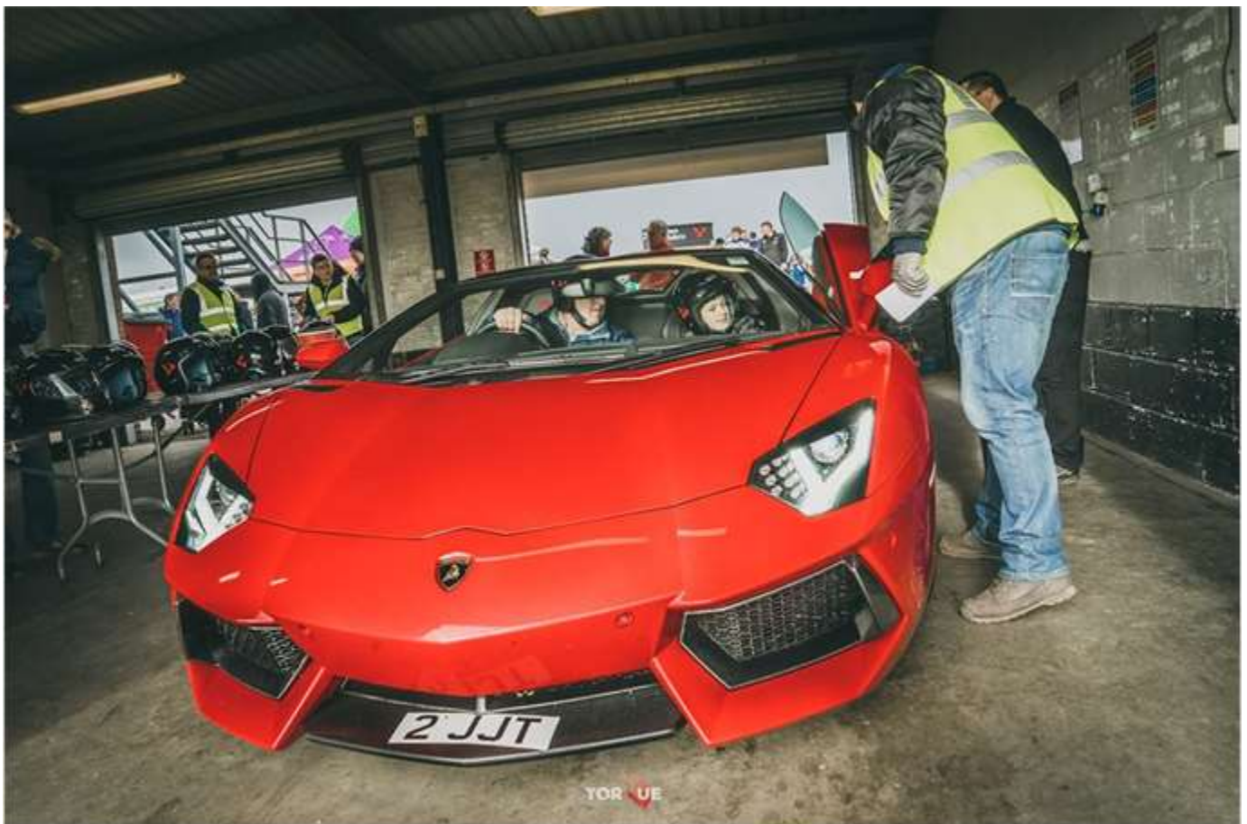
Snetterton Charity Day 2015