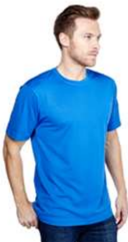
UC302 Premium Tee shirt UC103 Children's Tee shirt