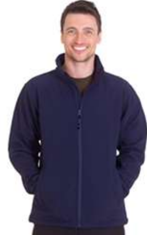
UC612 Classic soft-shell jacket 3-layer waterproof/breathable 2 zip outside pockets