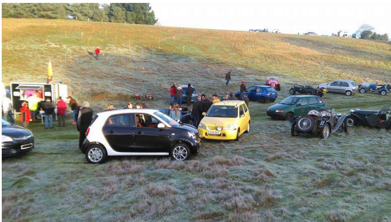
Seckford Hall – Friday 1 st January 2016

There will also be a third option, on the club website Home page there will be a link to a form containing the questions and this can be submitted directly to the Spotlight team. Slightly technical bit: if you have concerns that opting to receive the newsletter electronically will result in emails with large attachments then there is no need to worry, the email will only contain a link to a pdf file and will have no attachment, simply open the link and you will either be able to view the newsletter on line or download it to your PC, tablet etc. Links to previous newsletters can be found on the club website on the Spotlight page (from the Home page select Club Stuff from the left hand menu, then select Spotlight from the menu that appears as if by magic, then select a year from the tabs along the top, then open the link to your chosen month – I randomly picked April from 2010 and spent a few happy minutes reminiscing)