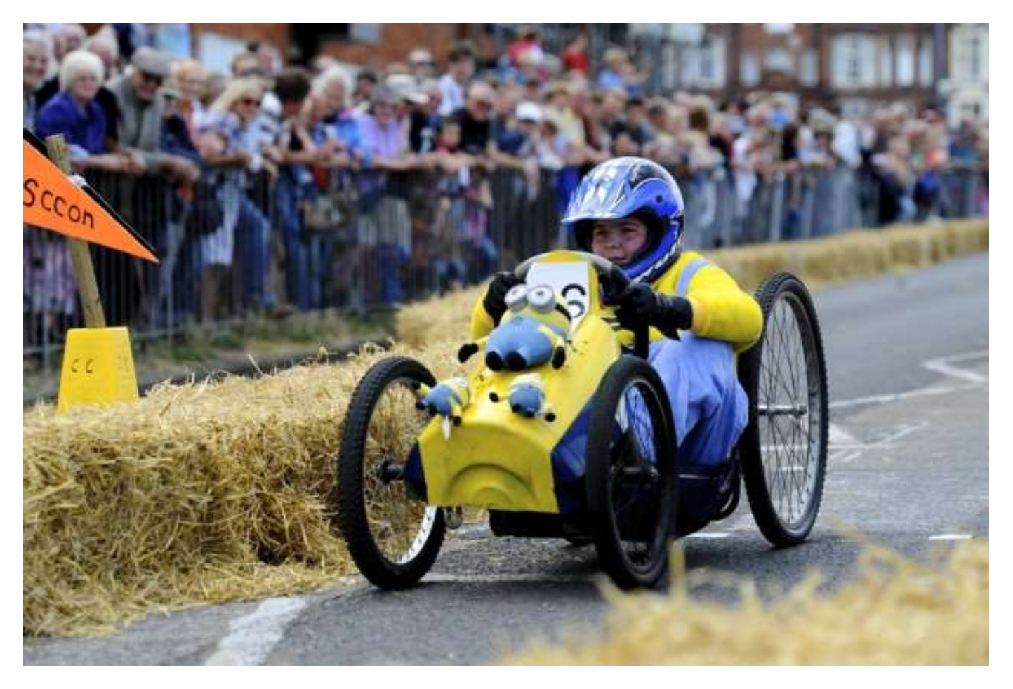
Cromer Carnival Soapbox Derby