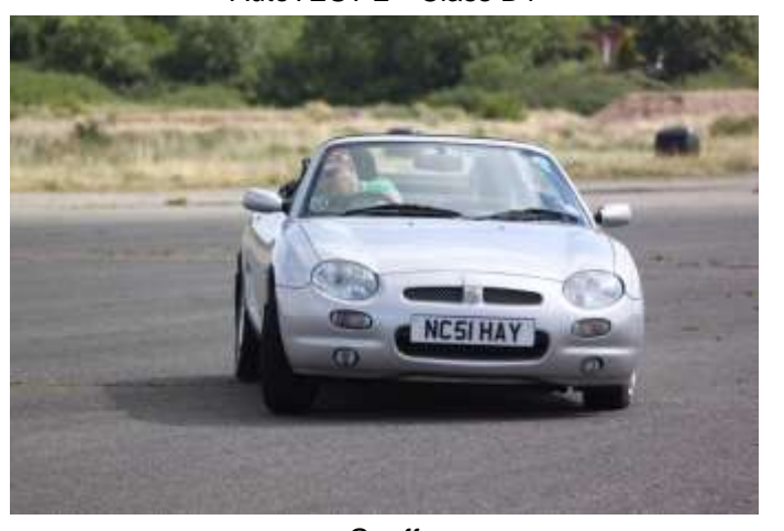
Geoff AutoTEST 1<sup>st</sup> Class E