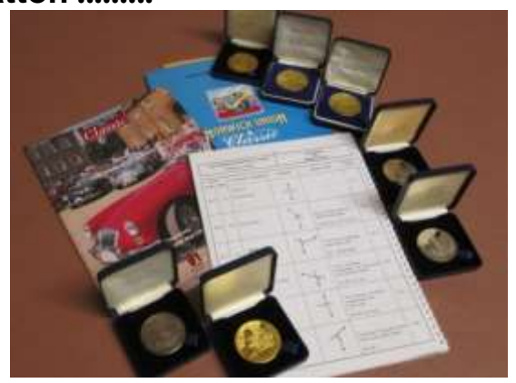
Souvenirs from previous Norwich Union Classic Car runs include programmes, a road book and finishers' medals.