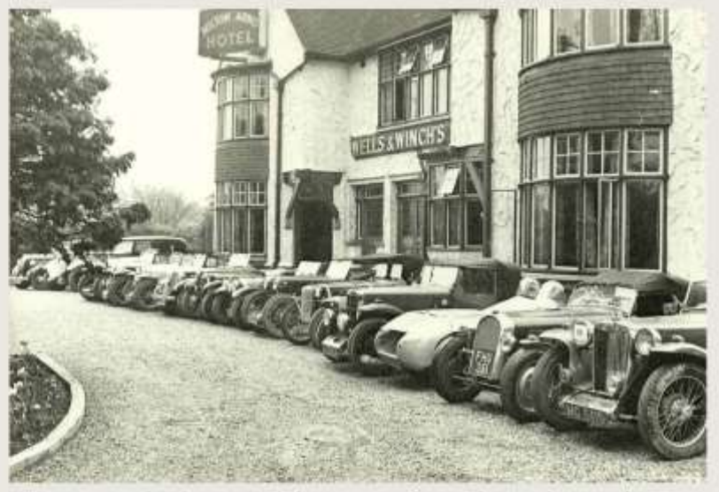
A Cambridge Car Club meeting from the early 1950's