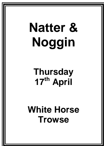
White Horse, Trowse NR14 8ST

Saturday 21 st June East Anglian Classic Chelmsford Motor Club