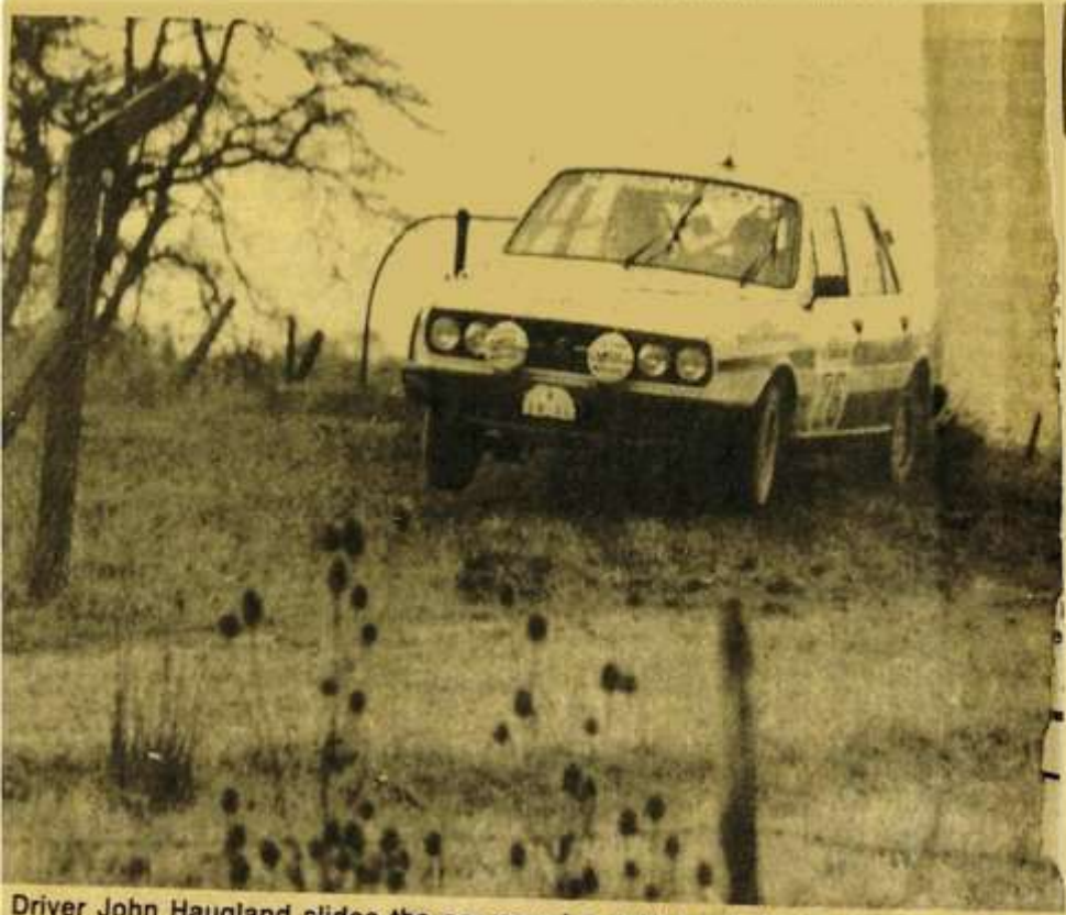
Driver John Haugland slides the car round a tight bend during trials near King's Lynn yesterday.

luxury trim and interior door are forsaken. The driver and co-driver have to be securely cradled in a sturdy metal cage. In their bucket seats they wear safety harnesses rather than conventional seat belts. RADIO UNITS Three types of radio intercom units have been installed in the Skoda rally cars to aid the tricky business of communication during the competition. Exposed components underneath the cars are protected with thick metal shields to combat the ravages of mud, mud and water. The Haugland, a 37-year-old Skoda dealer from Norway, it will be his eleventh RAC rally. It heads a multi-national Skoda team of six which includes 24-year-old woman, Monik Leibert, from West Germany. A back-up squad, including a team doctor, will be with them at the way. Skoda are looking for their eleventh class win in the RAC rally in as many years. The rally starts and ends at Bath, and takes in the Mullings North, southern Scotland, the Lake District and Wales.