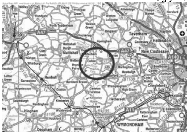
Ugly Bug Inn, Colton